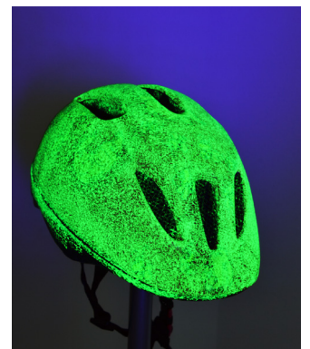
Speckled bike helmet