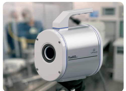
FlowBOS camera CR

The FlowBOS Camera CR uses advanced data-processing algorithms in combination with extremely optimized computational power that allows for real time visualization and quantification of the airflow. The obtained velocity data is presented as a colored augmentation to the airflow visualization based on aerosols or smoke.